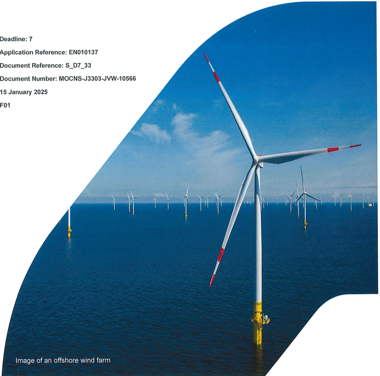
Image of an offshore wind farm